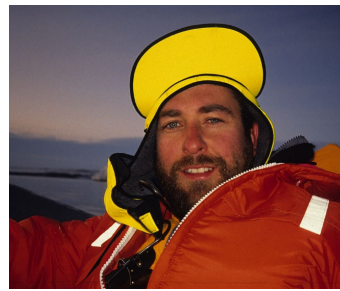
Casey Station, 1992