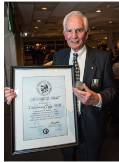
Receiving the Phil Law medal in 2015